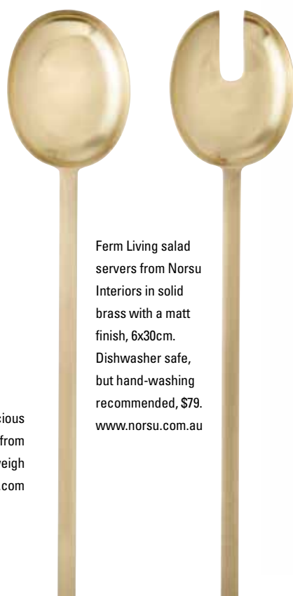
Ferm Living salad servers from Norsu Interiors in solid brass with a matt finish, 6x30cm. Dishwasher safe, but hand-washing recommended, $79. www.norsu.com.au

Decor accessories are the best and easiest way to incorporate some brass touches in your space. Look out for interesting little trinkets on your travels. You might even find the perfect piece in your local secondhand store. Also, brass cutlery makes a great addition to your tabletop, while a brass-legged side table would make a fabulous investment piece.