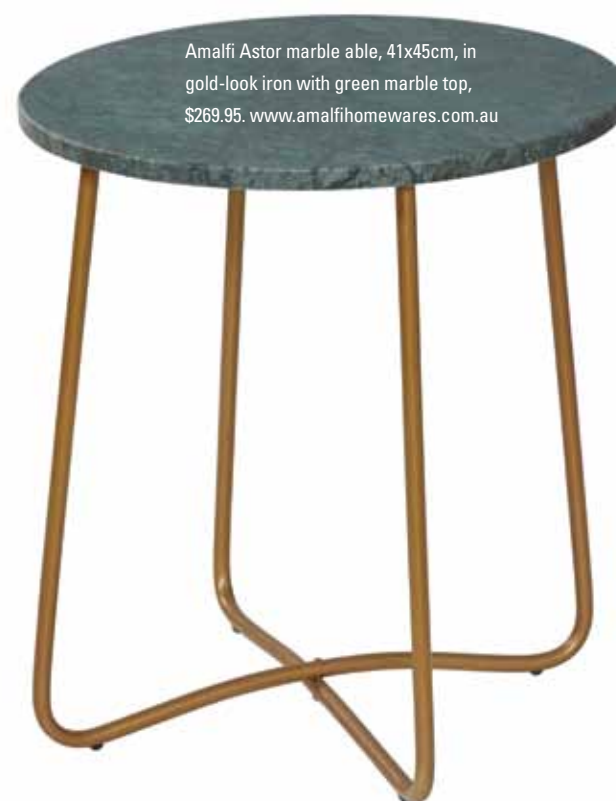
Amalfi Astor marble table, 41x45cm, in gold-look iron with green marble top, $269.95. www.amalfihomewares.com.au

Genuine crystals look lovely as part of a vignette (with some brass accessories!) on your coffee table or bedside. If you're not quite ready to embrace your inner god or goddess with a real crystal, keep your eye out for artworks featuring stones, sediments, glaciers and other nature-inspired subjects.